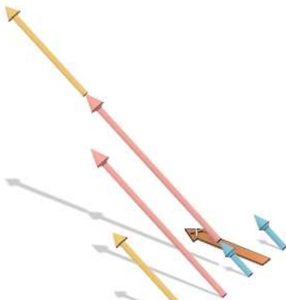
Figure 0-1 Projection Transformation

If you can identify four distinct directed arrows in figure 2.1, they are representing four vectors. The Brown arrow, (vector) labelled “ x ” is lying “on the ground” and the rest are on a different plane. Of the remaining three, there are two copies of each. For each color or size, there is a free-standing copy, and another copy in a pile up. What we see as shadows are called projections in the mathematical sense.